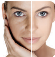
BEFORE 前 AFTER 后